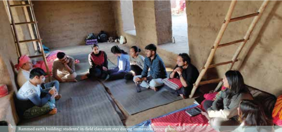
Rammed earth building: students' in-field class cum stay during immersion programme 2018