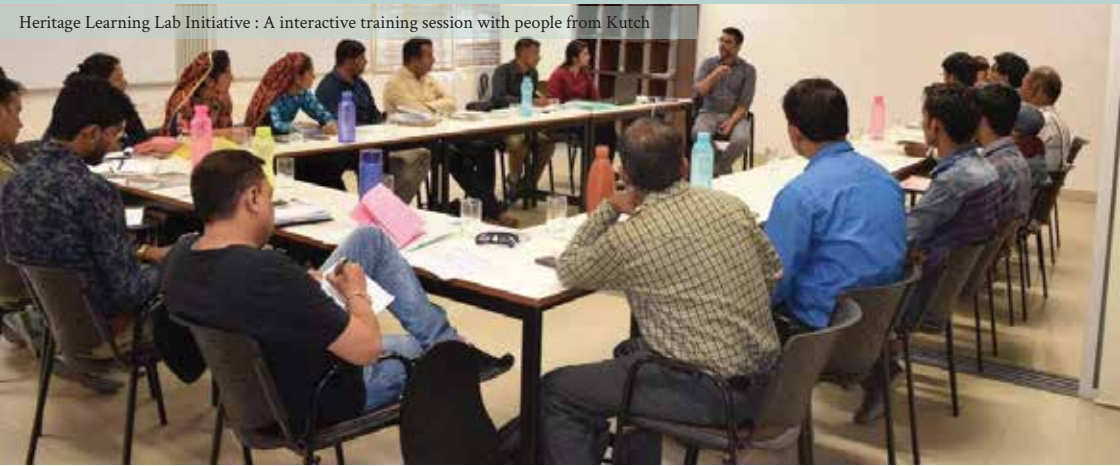
Heritage Learning Lab Initiative : A interactive training session with people from Kutch

Heritage Learning Lab (HLL) is conceptualised as a process of collaborative learning – in partnership with a specific community (represented through a local organisation) and contributing in a specific context to integrate heritage with community development. In practice, each HLL site may have different needs and modalities but essentially all of them will contribute to the students learning, while the students contribute back through the heritage related planning and development in the community/context.