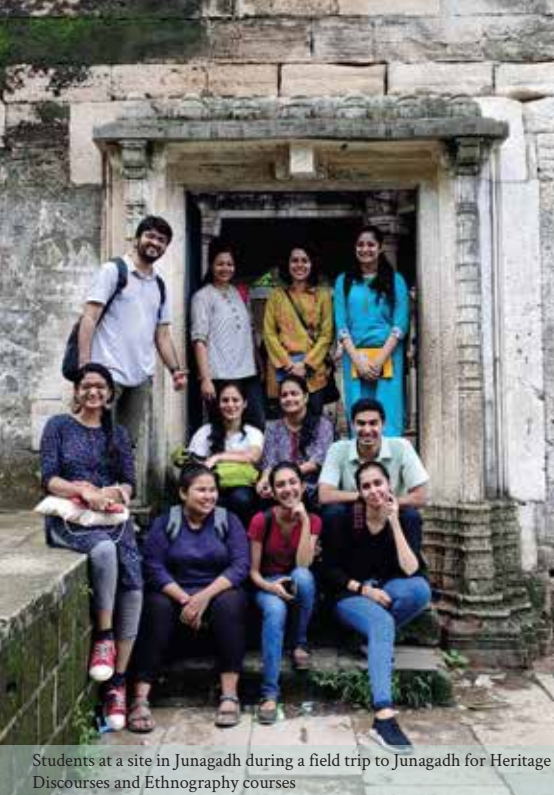
Students at a site in Junagadh during a field trip to Junagadh for Heritage Discourses and Ethnography courses