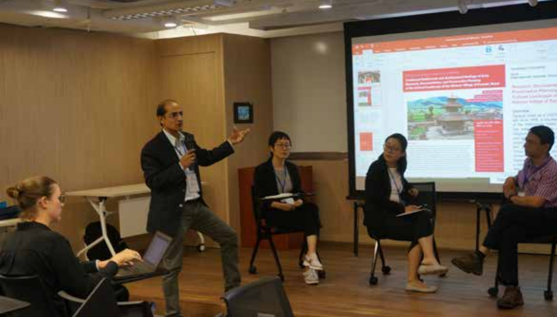
Our faculty during a deliberation at a meeting of Asian Academy of Heritage Management, HongKong