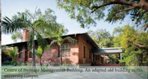
Centre of Heritage Management Building: An adapted old building in the university campus.

Ahmedabad University is a private, non-profit, liberal education oriented, research driven university developing rapidly into a centre for serious scholarship. Since its inception in 2009, the University has made strides through global collaborative research, contextual and flexible curriculum, project based learning, and industry linkages; thus offering a unique learning environment and opportunity for society at large.