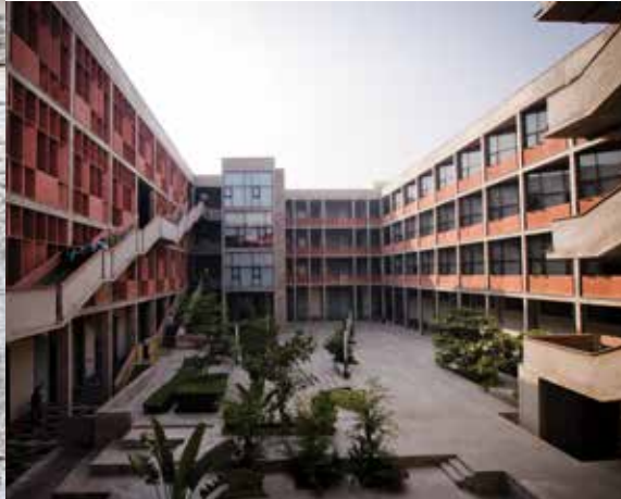
Courtyard at the GICT Building, Central Campus