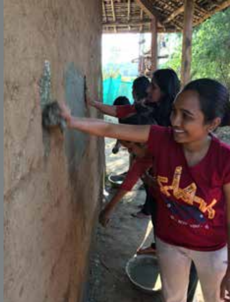
Students' learning a traditional wall treatment technique at Immersion Module at the Polo forest in Vijaynagar

The Master's programme in Heritage Management at Ahmedabad University has been appreciated at these Asia Pacific regional networks as a pioneering intellectual initiative to prepare graduates who contribute holistically to the myriad domains of heritage. Importantly, the graduates of the programme, are creating a meaningful impact in the society in multiple ways. The prospective students need to be prepared to study and practice responsibly, be self-motivated and adequately equipped to handle complex social issues deploying the principles of Heritage Management. In line with the programme's design to prepare graduates for a new range of professional careers in the diverse arrays of heritage sector, Ahmedabad University is looking to admit a new cohort of committed students drawing upon diverse disciplinary, geographic and cultural backgrounds.