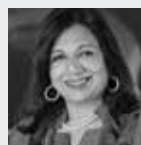
KIRAN MAZUMDAR SHAW

CHAIRPERSON AND MANAGING DIRECTOR BIOCON LIMITED