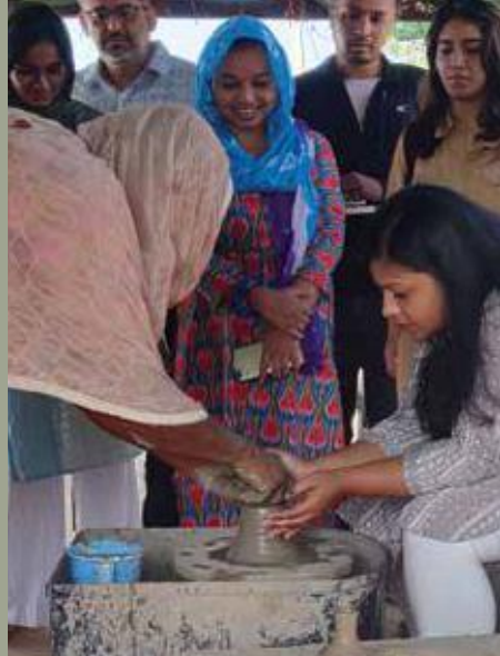
Students learning the local traditional crafts during their field immersion in Kachchh

More importantly, the graduates are creating a meaningful impact in society in multiple ways. It is in this context that Ahmedabad University is looking to admit a new cohort of committed students drawing upon diverse disciplinary, geographic and cultural backgrounds.