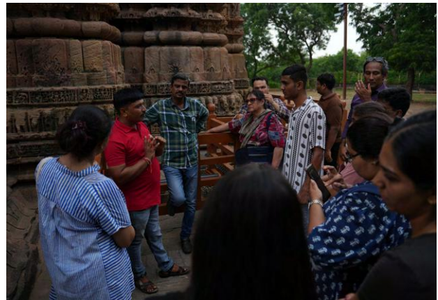
Participants visiting the Sun Temple at Modhera