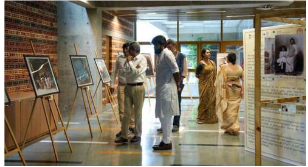
Exhibition on the Photographic Mastery of Raja Deen Dayal