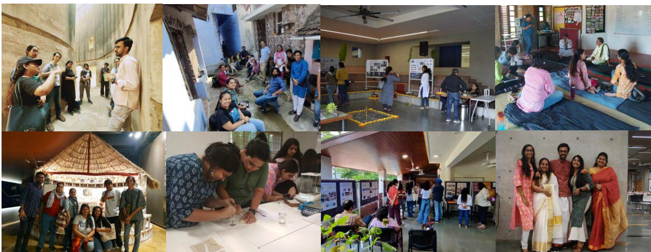
From top left to right bottom: Visit and on-site discussion at Bhadra fort during Urban Management lecture, The group of student during their Immersion trip to Tamil Nadu, Immersion Symposium held at the University, Group discussions at Ramble campus during IKS study tour, batch at Smritivan Earthquake Museum, Hands-on Conservation experience during Conservation Principles and Processes lecture, Practicum Symposium at CHM, and during the Onam celebrations 2023.