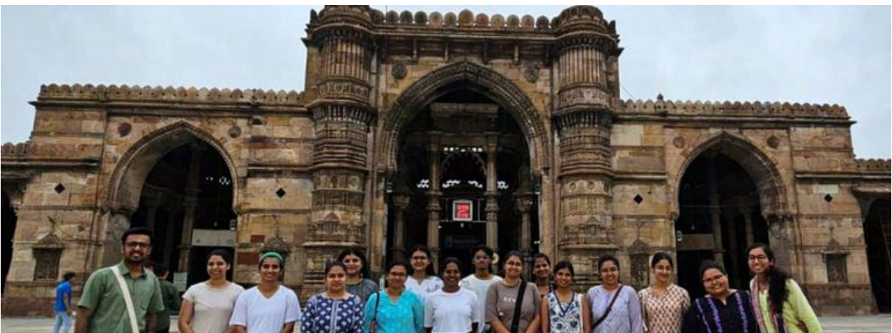
Heritage Walk of the new students in the Old City of Ahmedabad

In addition to exploring the rich cultural heritage of Ahmedabad, students also toured the Ahmedabad University campus, gaining insight into the various extracurricular activities available at the University.