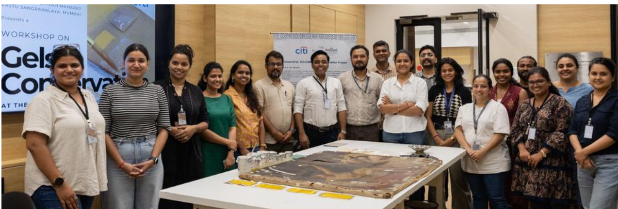
Participants of the capacity-building national workshop on Gels in Art Conservation

Professor Aditya Prakash Kanth conducted a capacity-building national workshop on “Gels in Art Conservation” at Chhatrapati Shivaji Maharaj Vastu Sangrahalaya (CSMVS), Mumbai, from September 23-25, 2024. In this workshop, organized by the Conservation Laboratory at CSMVS Museum, he introduced the latest gel cleaning systems and techniques used in art conservation for cleaning various heritage surfaces and discussed the chemistry of gel systems, preparations, modifications, and various types of applications.