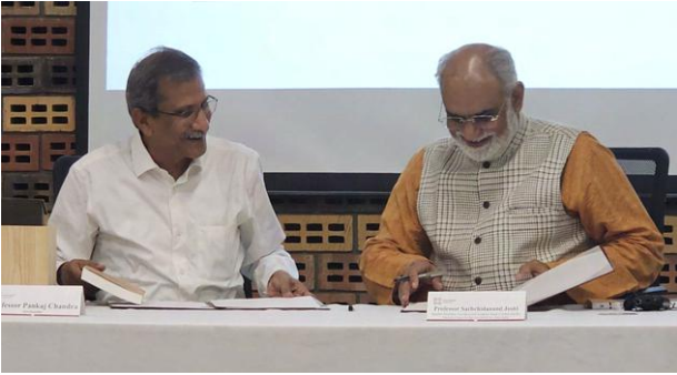
MoU signed between IGNCA and Ahmedabad University