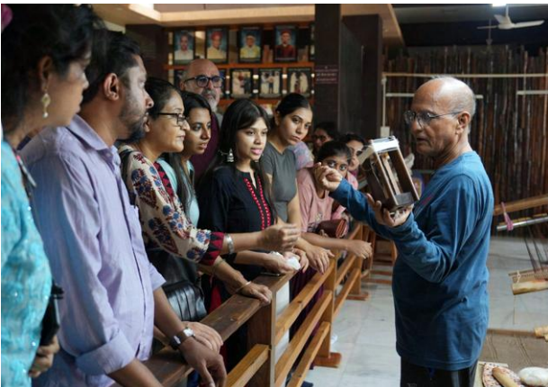
Participants visiting the Patan Patola Heritage Museum