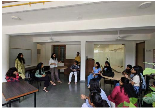
Interaction with seniors and alumni

The Centre welcomed its new cohort of students with a series of engaging activities that allowed them to explore both Ahmedabad University and the city of Ahmedabad. Students had the opportunity to interact with the Centre's faculty and alumni, who shared their experiences and participated in various icebreaker activities.