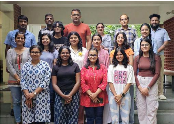
Cohort of 2024-2026 with CHM Faculty