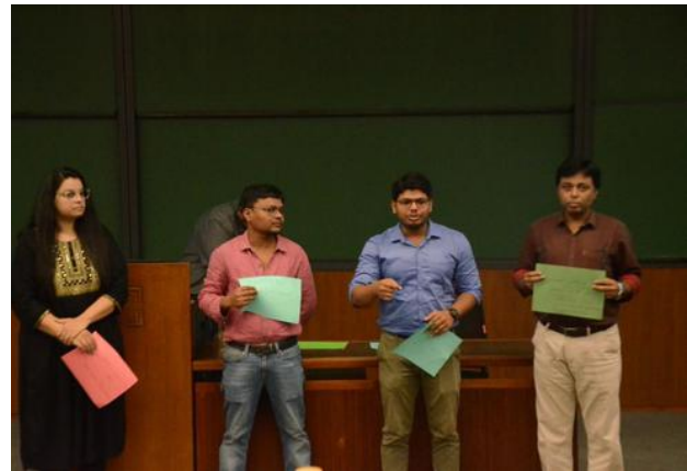
Participants presenting their views on an assigned topic

The last day of the workshop brought the participants together to discuss informally several important themes integral to heritage preservation and management today. They explored the societal impact and the problems and issues related to each theme. Participants explored themes such as community participation, ownership, ethics, natural heritage, technology, difficult heritage, and climate change. Through these discussions and deliberations, each participant tried to gain a comprehensive understanding of various aspects of heritage management and how to navigate through it in today's context.