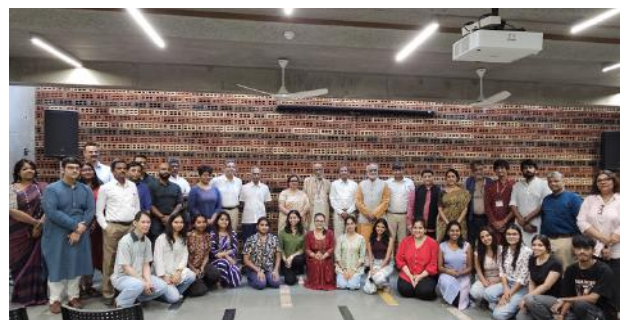
Participants of this event