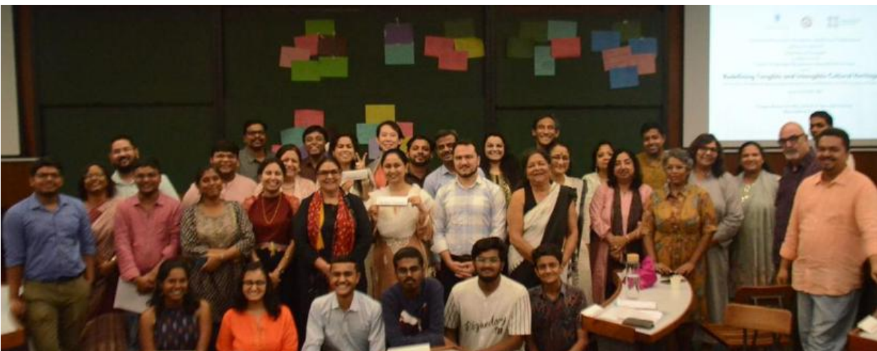
Participants of Redefining Tangible and Intangible Cultural Heritage workshop

The last day of the workshop brought the participants together to discuss informally several important themes integral to heritage preservation and management today. They explored the societal impact and the problems and issues related to each theme. Participants explored themes such as community participation, ownership, ethics, natural heritage, technology, difficult heritage, and climate change. Through these discussions and deliberations, each participant tried to gain a comprehensive understanding of various aspects of heritage management and how to navigate through it in today's context.