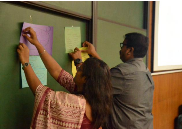
Participants highlighting keywords for each theme