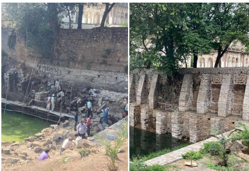
Before (left) and after (right) conservation of Buttresses at the Eastern Baoli based on on-site evidence.