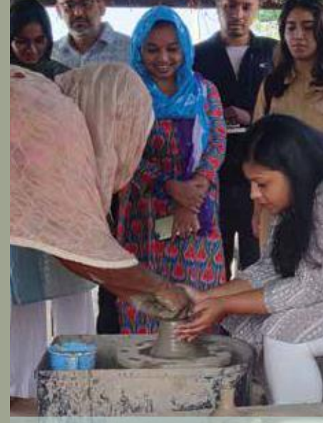
Students learning the local traditional crafts during their field immersion in Kachchh

More importantly, the graduates are creating a meaningful impact in society in multiple ways. It is in this context that Ahmedabad University is looking to admit a new cohort of committed students drawing upon diverse disciplinary, geographic and cultural backgrounds.